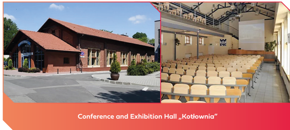
Conference and Exhibition Hall „Kotłownia”