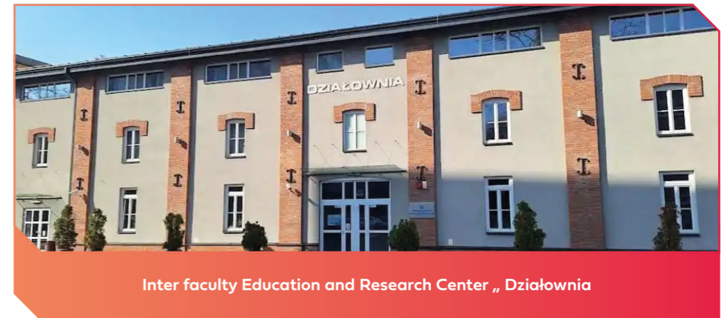
Inter faculty Education and Research Center „Działownia